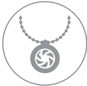
SMART ACCESSORY SECURITY

JANUARY 25 - 27, 2019 | KENT STATE UNIVERSITY